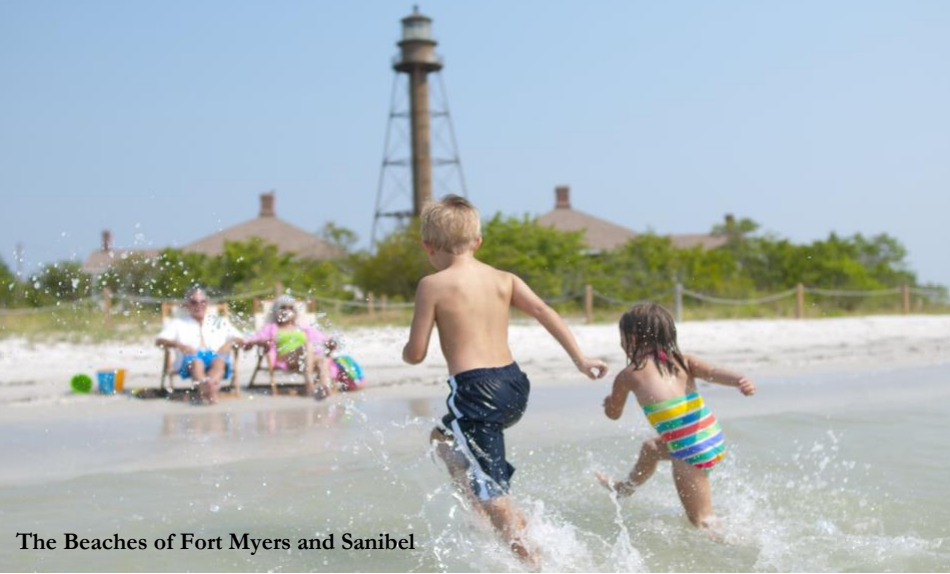
The Beaches of Fort Myers and Sanibel