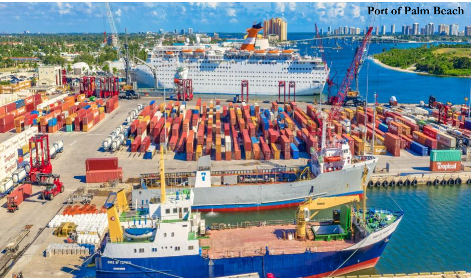
Port of Palm Beach